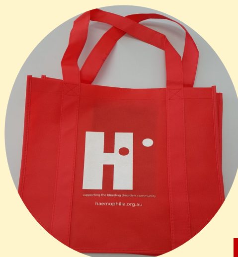
Red Shopping Bag 33cm W x 35cm H