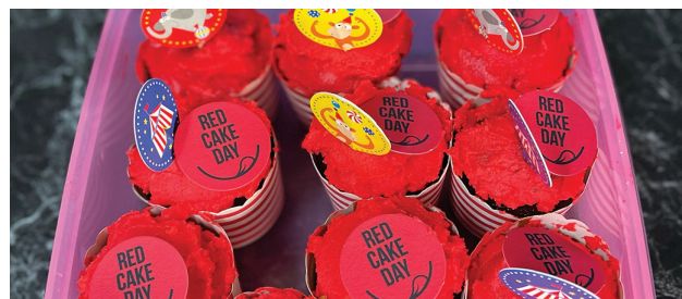
Remy's daycare class had yummy cupcakes