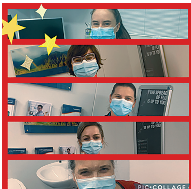
John Hunter Children's Hospital