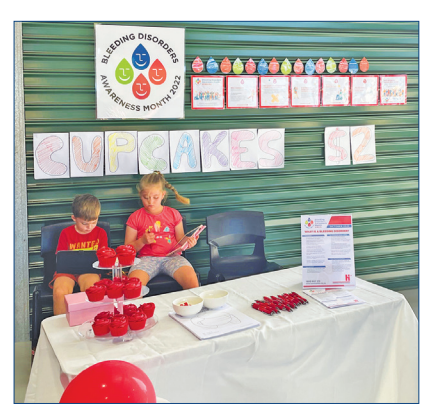
Weipa Town Authority Disaster Expo Stall