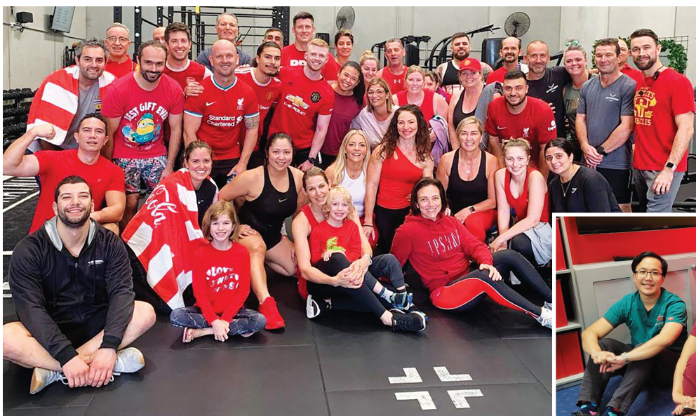
◀ Performance Personal Training

Thank you to everyone who participated in the day.