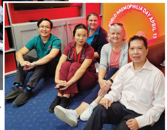
The Haemophilia Treatment Centre team from the Children's Hospital at Westmead ▶