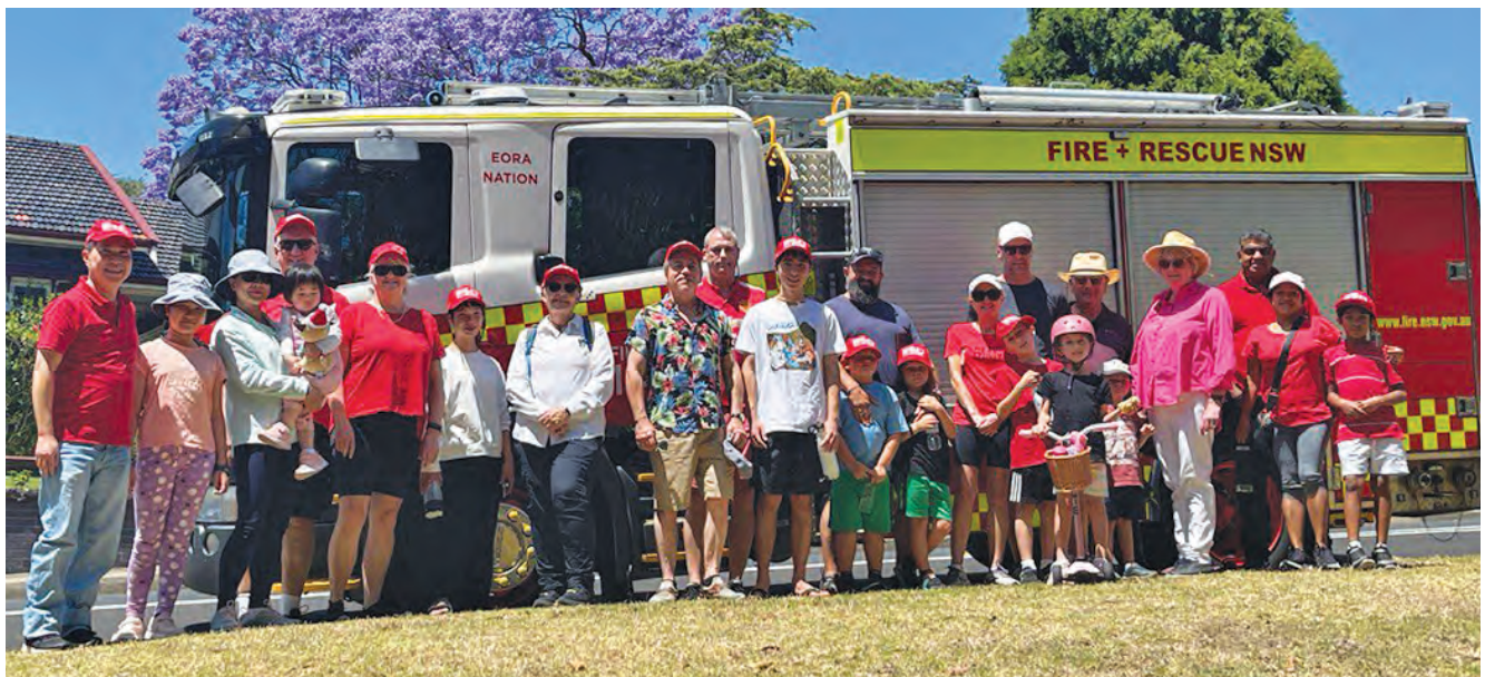
HFNSW Family Day