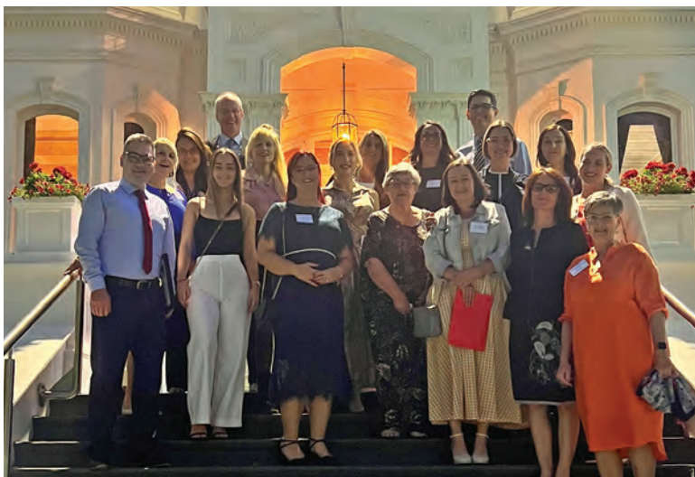
HFQ at Government House