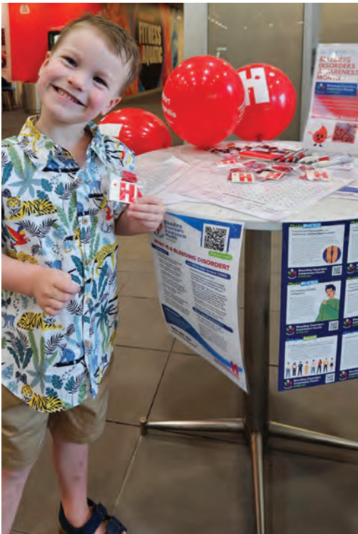
Dolphins Aquatic and Fitness Centre, Redcliffe, QLD