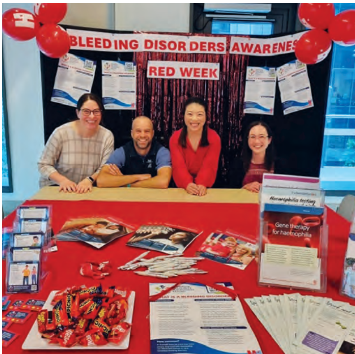
HTC, Royal Adelaide Hospital