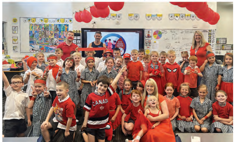
Lincoln and friends