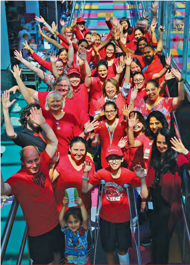
HTC team at The Children's Hospital at Westmead, NSW